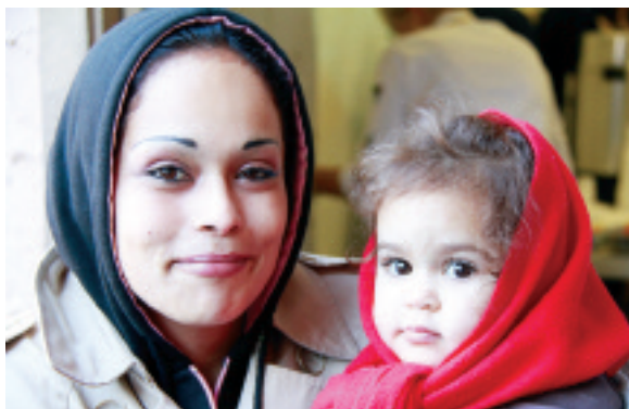
On their Pathway to Home