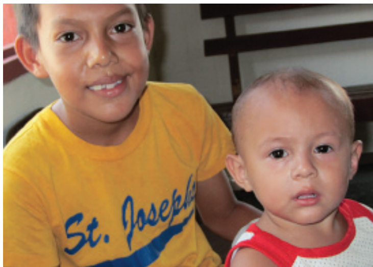
Village boys served by Mountain of Hope in Honduras